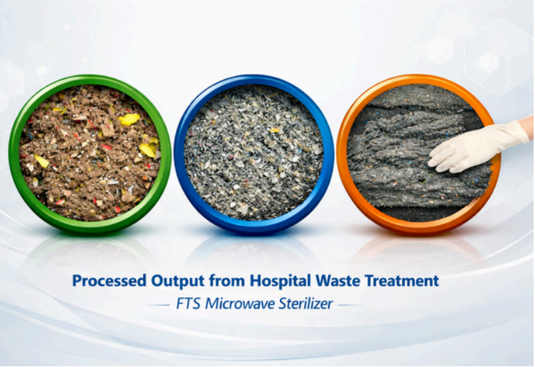
Processed Output from Hospital Waste Treatment — FTS Microwave Sterilizer —